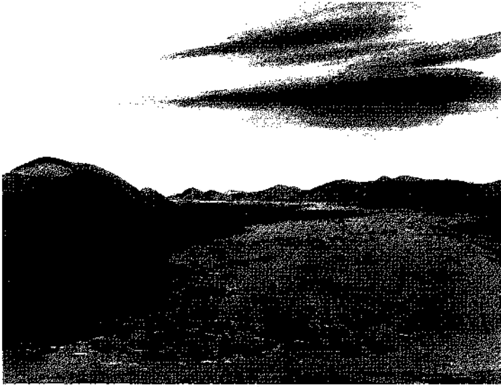
Buffalo Herds Crossing the Upper Missouri. Each year, thousands of bison drowned crossing the Missouri River. Their carcasses provided the semisedentary and only partially mounted Mandans, Hidatsas, and Arikaras along the middle Missouri with a reliable source of meat. Painting by George Catlin, 1832.

was to secure additional winter forage, such as cottonwood bark, for horses. In late spring the Indians returned to the open grasslands, where they broke into numerous small groups that migrated constantly, carefully coordinating their moves to guarantee a steady supply of grass and fresh, low-saline water for their herds. Hunting assumed a greater role, but since the horses demanded continuous management and protection, major hunting efforts had to be limited to a few concentrated sprees. The southern Plains Indians did most of their hunting in early summer, when their horses had recovered from the hardships of winter, and in late fall, when bison had completed mating and had grown their thick winter robes. Those brief, communitywide hunts were the only time when the scattered bands could come together and nourish a sense of tribal identity and communal solidarity. The southern Plains Indians were not full-fledged pastoralists in that they still relied on bison for the bulk of their dietary needs and used horseflesh only as an emergency food. By all other criteria, however, they had become pastoral people. 15