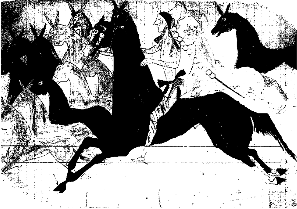
Yellow Horse, a Cheyenne, captures a herd of mules in this Native American drawing (c. 1865–1870). The sturdy mules, resilient even in hot climates, were highly valued as draft animals by the southern and central Plains pastoralists. Peter J. Powell, People of the Sacred Mountain: A History of the Northern Cheyenne Chiefs and Warrior Societies, 1830–1879 (2 vols., New York, 1981), II, 545.

which forced the less mobile villagers to acquire even more horses and thus to place even greater pressure on local environments. 45