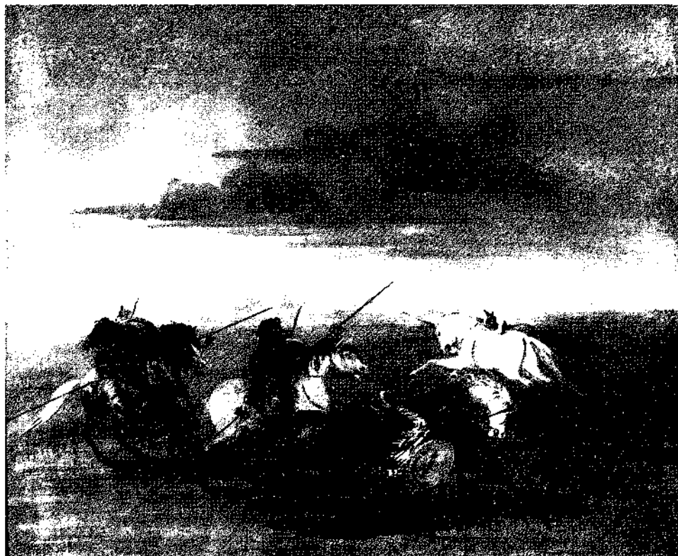
Comanche Feats of Horsemanship. The Comanches, the most renowned of the Plains horse pastoralists and traders, demonstrated to George Catlin how they used horses' bodies as shields when attacking. Painting by George Catlin, 1834–1835.

the Black Hills to the central Plains, positioning themselves between the Arkansas center and the Mandan-Hidatsa trade nexus on the middle Missouri River. By this time, the Comanche and Kiowa livestock economy had reached such magnitude that Cheyennes and Arapahoes could become highly specialized intermediaries. Trade was disrupted briefly in the 1830s, when Cheyennes and Arapahoes made a bid to monopolize access to the newly established Bent's Fort on the Arkansas River, but commercial gravity soon pulled the tribes back together. The four tribes formed a peace in 1840, agreed on a joint occupancy of the Arkansas basin, and embarked on extensive livestock trade with Charles and William Bent, who in turn supplied the Santa Fe traders, overlanders, and the booming mule industry in Missouri. 11